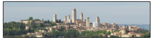
San Gimignano (Tuscany, Italy)

B. How dramatic this "competition" to build higher and bigger towers was is shown on this drawing reconstructing medieval Bologna.